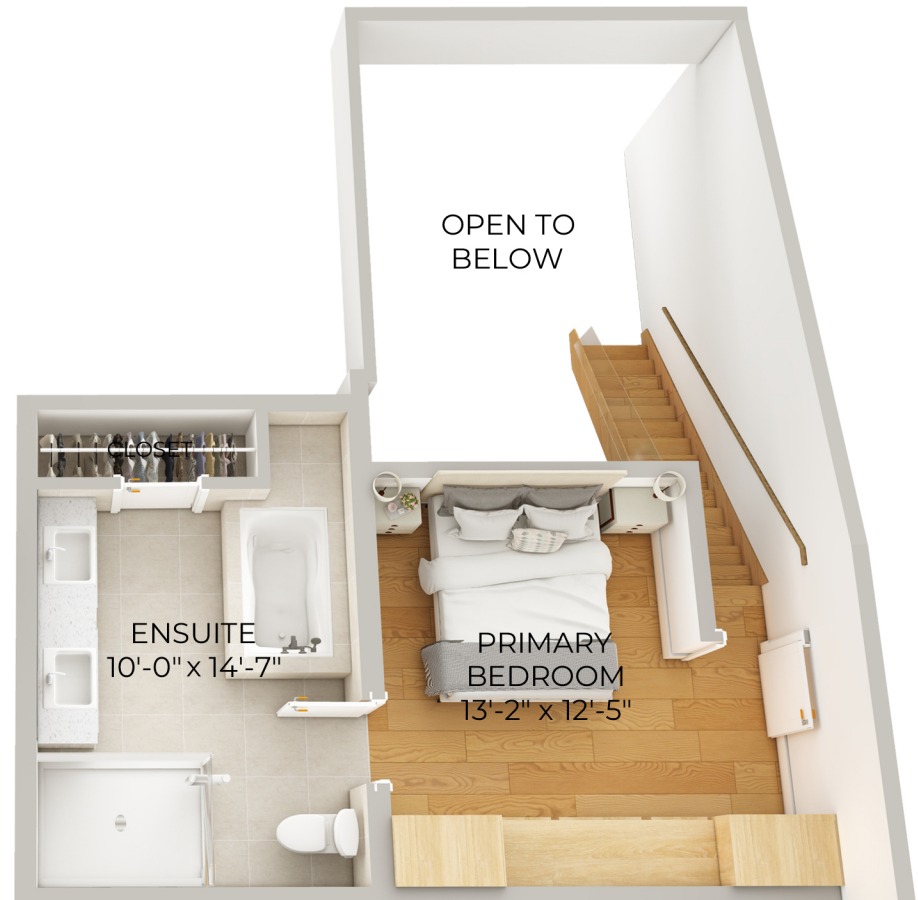
UPPER FLOOR PLAN Vaulted Ceiling Height: 9'-9"