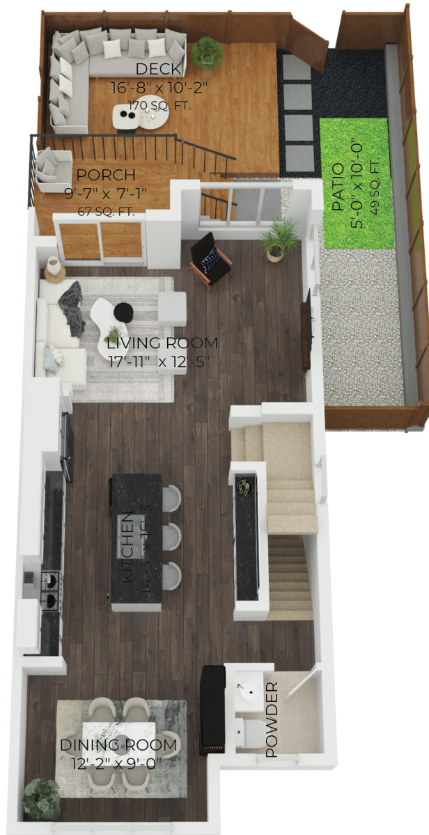
MAIN FLOOR PLAN Ceiling Height: 8'-0"