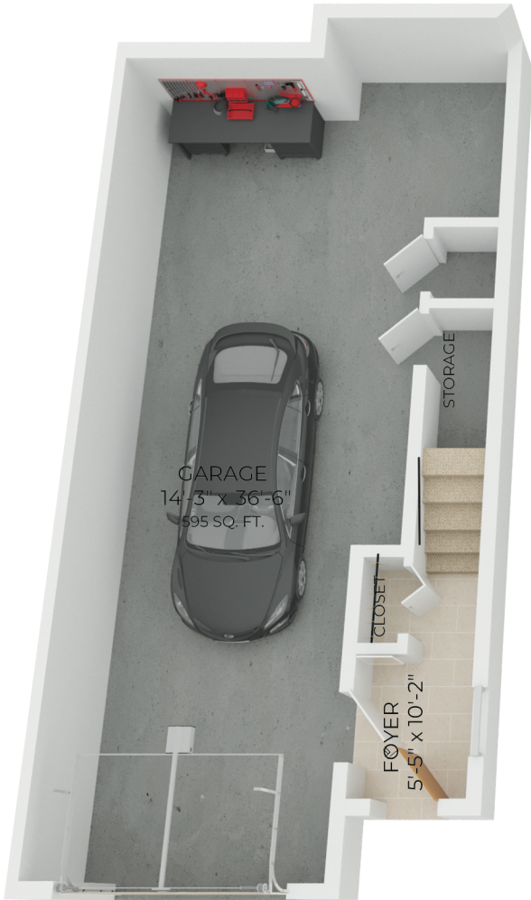
LOWER FLOOR PLAN Ceiling Height: 8'-0"

Porch: 67 SQ. FT. Deck: 170 SQ. FT. Patio: 49 SQ. FT. Garage: 595 SQ. FT.