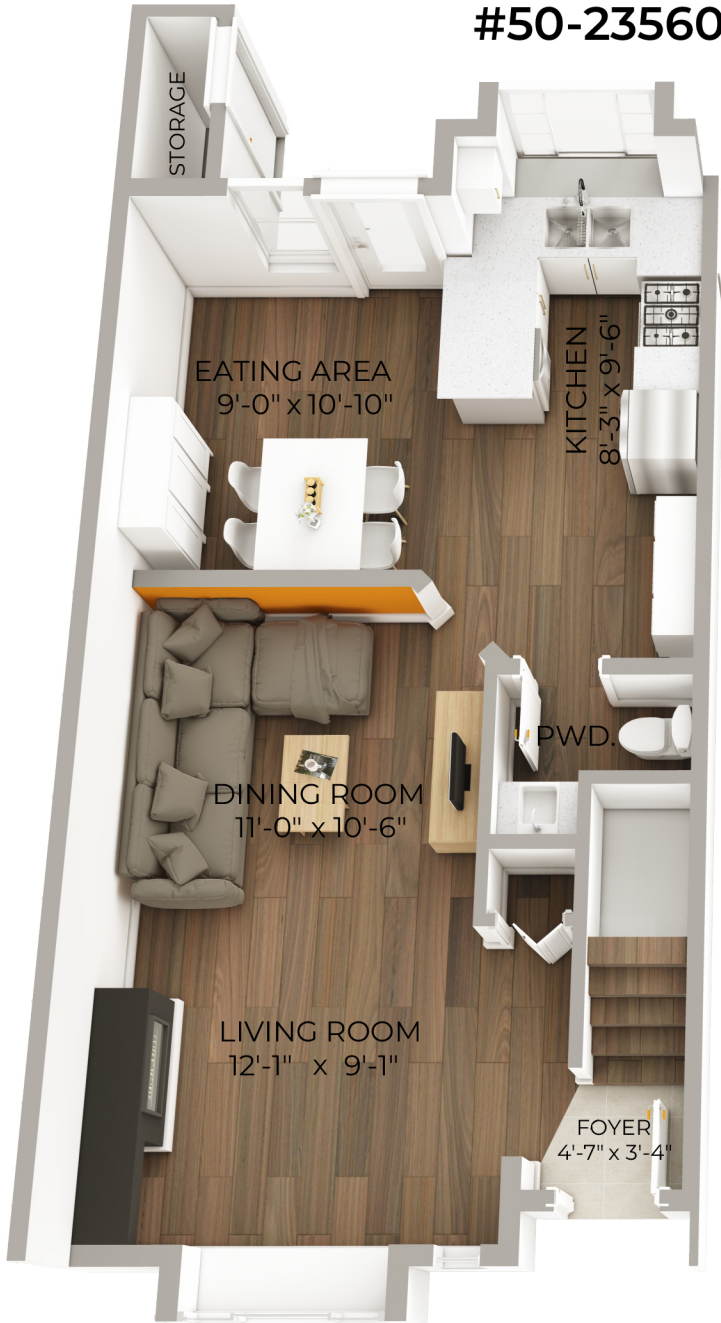
MAIN FLOOR PLAN Ceiling Height: 8'-0"