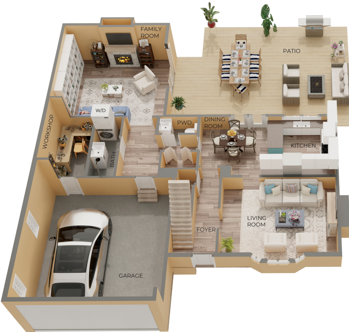
MAIN FLOOR PLAN Ceiling Height: 8'-0"