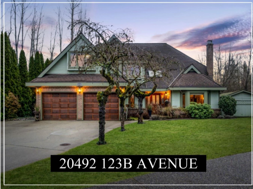
20492 123B AVENUE

Residential Detached $1,488,800 (LP) (SP)