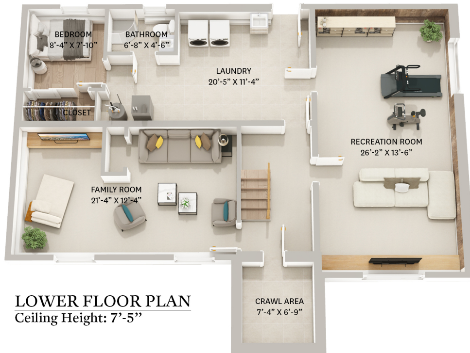
LOWER FLOOR PLAN Ceiling Height: 7'-5"

LOWER FLOOR TOTAL: 1,166 SQ.FT. GARAGE: 376 SQ. FT. MAIN FLOOR TOTAL: 1,166 SQ.FT. DECK: 244 SQ. FT. TOTAL: 2,332 SQ.FT.