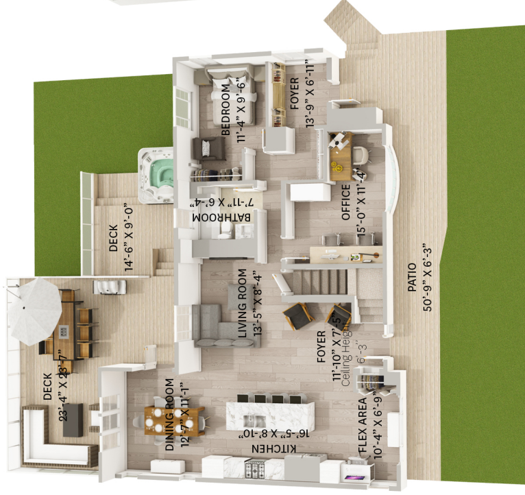
MAIN FLOOR PLAN Ceiling Height: 7'-11"