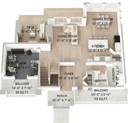
MAIN FLOOR PLAN Ceiling Height: 10'-0"