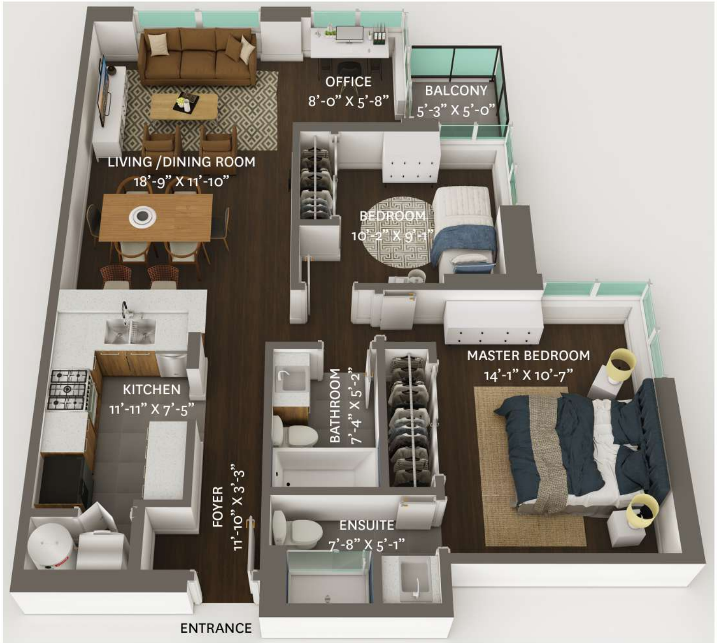
MAIN FLOOR PLAN Ceiling Height: 7'-11"

MAIN FLOOR TOTAL: 946 SQ. FT. BALCONY: 30 SQ. FT.