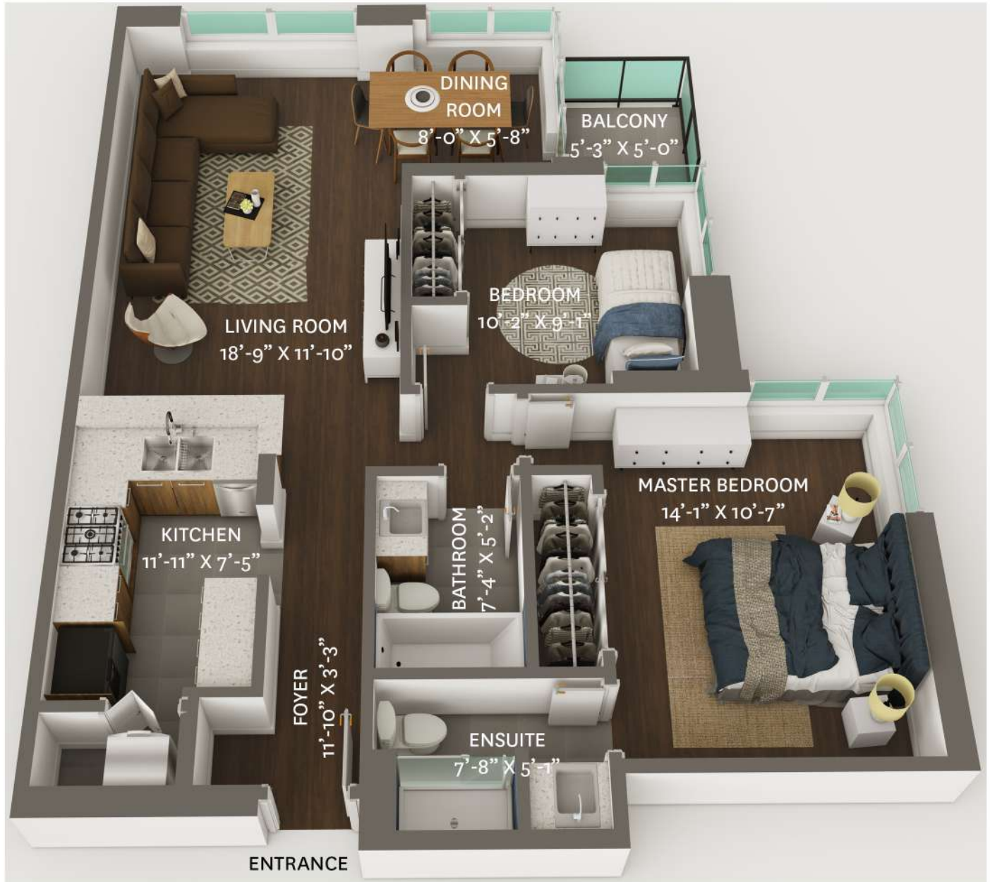
MAIN FLOOR PLAN Ceiling Height: 7'-11"

MAIN FLOOR TOTAL: 946 SQ. FT. BALCONY: 30 SQ. FT.