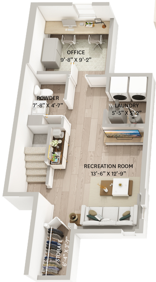
LOWER FLOOR PLAN Ceiling Height: 7'-3"