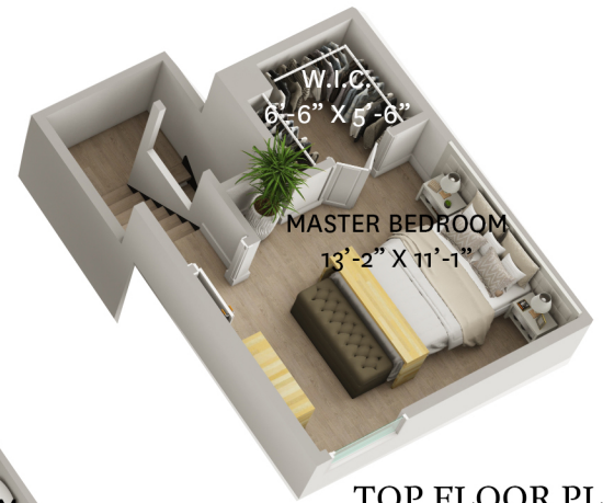
TOP FLOOR PLAN Ceiling Height: 8'-0"