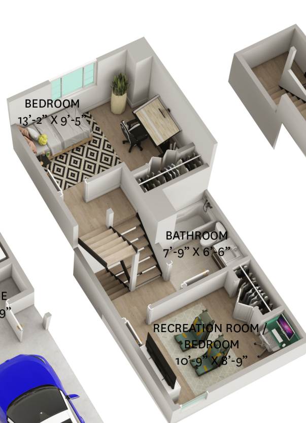
UPPER FLOOR PLAN Ceiling Height: 8'-0"