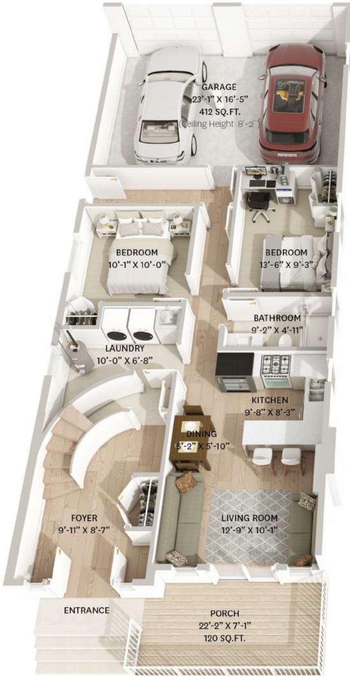
LOWER FLOOR PLAN Ceiling Height: 7'-11"

LOWER FLOOR TOTAL: 900 SQ.FT. GARAGE: 412 SQ. FT. MAIN FLOOR TOTAL: 1,337 SQ.FT. DECK TOTAL: 178 SQ. FT. TOTAL: 2,237 SQ.FT. PORCH: 120 SQ. FT.