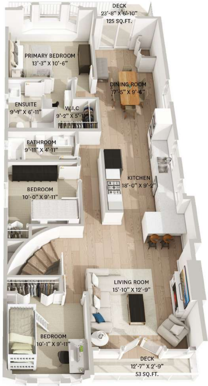
MAIN FLOOR PLAN Ceiling Height: 8'-0"