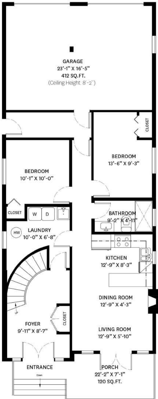
LOWER FLOOR PLAN Ceiling Height: 7'-11"

LOWER FLOOR TOTAL: 900 SQ.FT. GARAGE: 412 SQ. FT. MAIN FLOOR TOTAL: 1,337 SQ.FT. DECK TOTAL: 178 SQ. FT. TOTAL: 2,237 SQ.FT. PORCH: 120 SQ. FT.