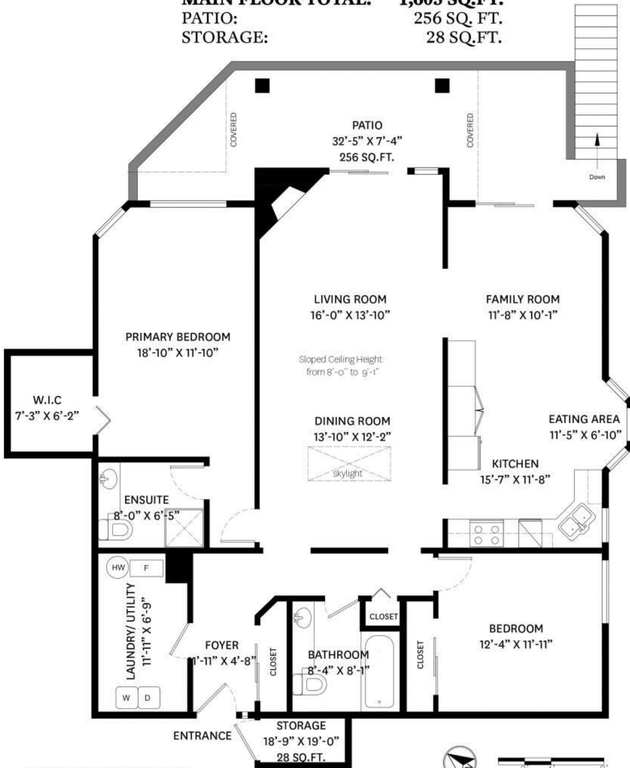
MAIN FLOOR PLAN Ceiling Height: 8'-0"

MAIN FLOOR TOTAL: 1,605 SQ.FT. PATIO: 256 SQ. FT. STORAGE: 28 SQ.FT.