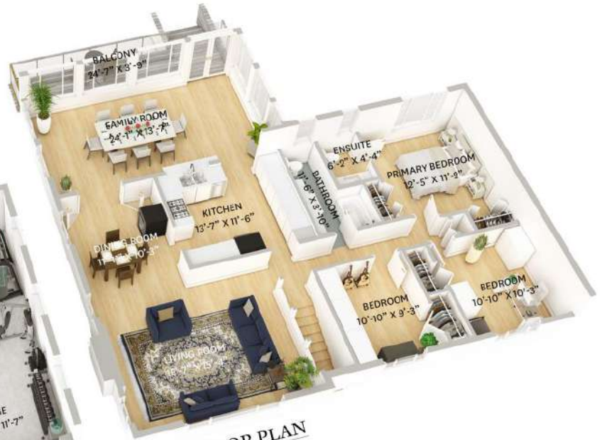
MAIN FLOOR PLAN Ceiling Height: 8'-0"