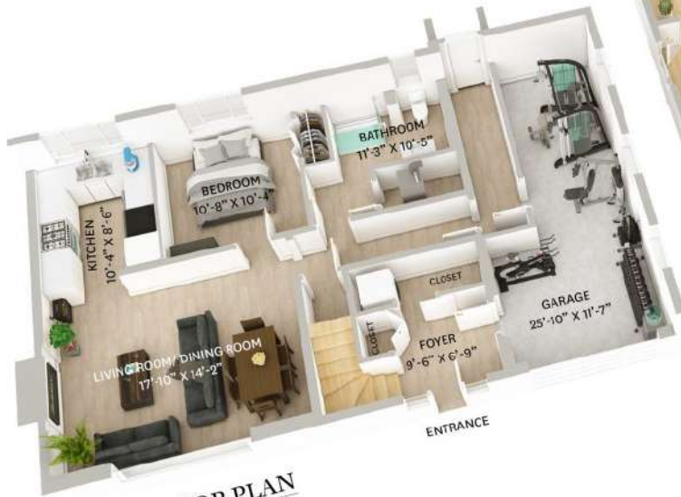
LOWER FLOOR PLAN Ceiling Height: 8'-0"

LOWER FLOOR TOTAL: 941 SQ.FT. MAIN FLOOR TOTAL: 1,616 SQ.FT. TOTAL: 2,557 SQ.FT. GARAGE: 272 SQ. FT. BALCONY: 99 SQ. FT.