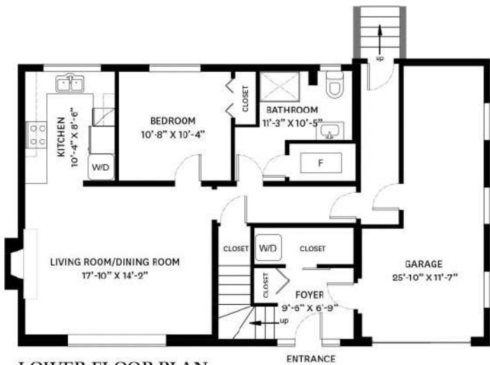
LOWER FLOOR PLAN Ceiling Height: 8'-0"

LOWER FLOOR TOTAL: 941 SQ.FT. MAIN FLOOR TOTAL: 1,616 SQ.FT. TOTAL: 2,557 SQ.FT. GARAGE: 272 SQ. FT. BALCONY: 99 SQ. FT.