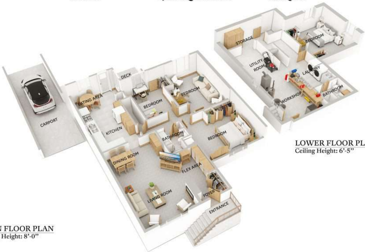
MAIN FLOOR PLAN Ceiling Height: 8'-0"

LOWER FLOOR TOTAL: 834 SQ.FT. CARPORT: 350 SQ. FT. MAIN FLOOR TOTAL: 1,283 SQ.FT. UNFINISHED: 140 SQ.FT. TOTAL: 2,117 SQ.FT. DECK: 94 SQ. FT.