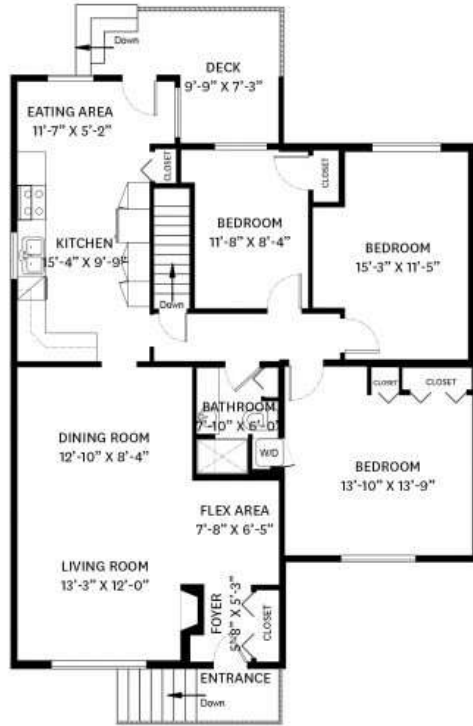
MAIN FLOOR PLAN Ceiling Height: 8'-0"