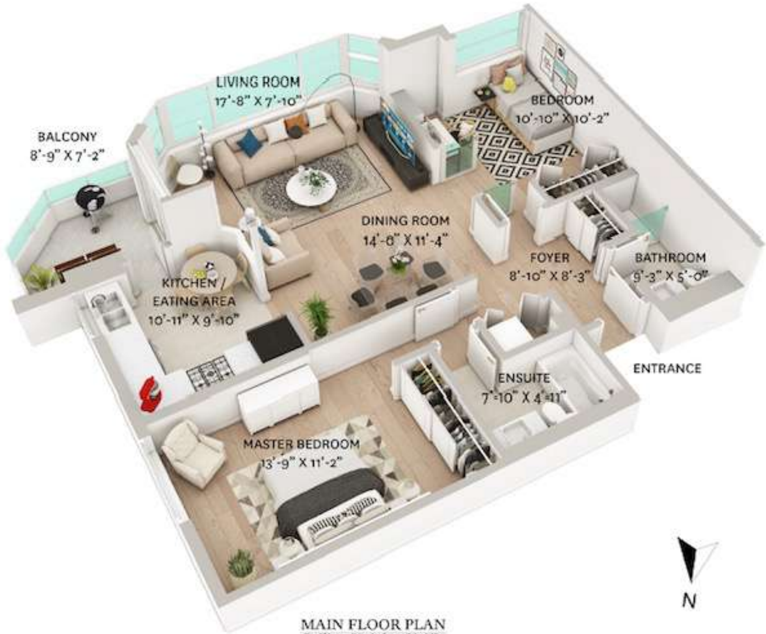
MAIN FLOOR PLAN Ceiling Height: 8'-0"

MAIN FLOOR TOTAL: 1,000 SQ. FT. BALCONY: 63 SQ. FT.