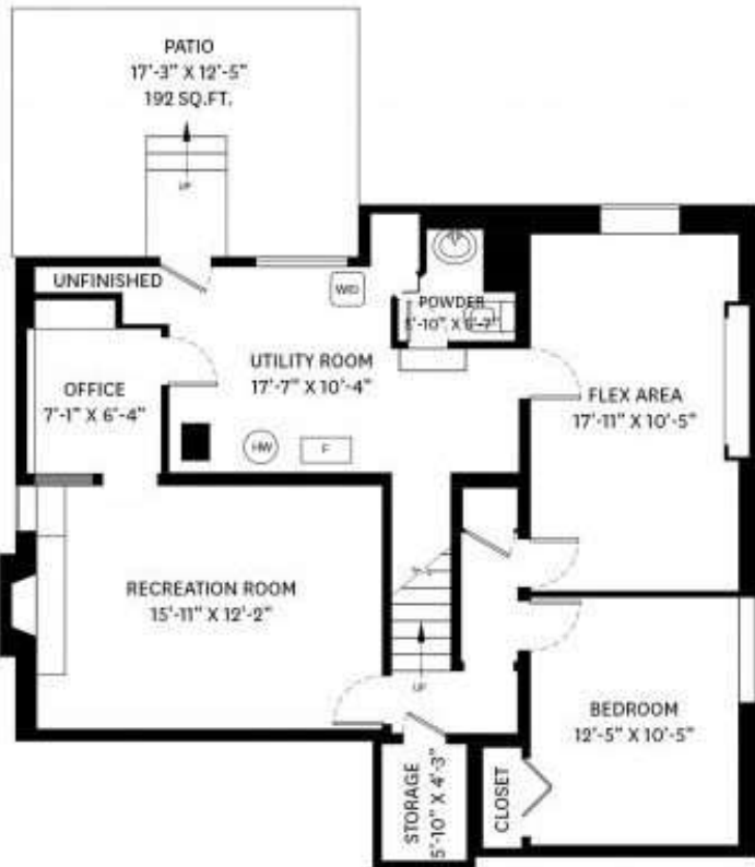
LOWER FLOOR PLAN Ceiling Height: 7'-9"

LOWER FLOOR TOTAL: 1,042 SQ.FT. GARAGE: 605 SQ. FT. MAIN FLOOR TOTAL: 1,092 SQ.FT. PATIO: 192 SQ. FT. TOTAL: 2,134 SQ.FT. DECK: 151 SQ. FT. UNFINISHED TOTAL: 26 SQ.FT. BALCONY: 43 SQ. FT. GRAND TOTAL: 2,160 SQ.FT.