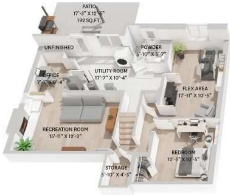
LOWER FLOOR PLAN Ceiling Height: 7'-9"

LOWER FLOOR TOTAL: 1,042 SQ.FT. GARAGE: 605 SQ. FT. MAIN FLOOR TOTAL: 1,092 SQ.FT. PATIO: 192 SQ. FT. TOTAL: 2,134 SQ.FT. DECK: 151 SQ. FT. UNFINISHED TOTAL: 26 SQ.FT. BALCONY: 43 SQ. FT. GRAND TOTAL: 2,160 SQ.FT.