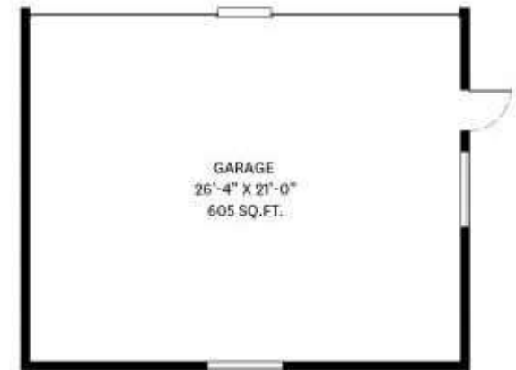
GARAGE Ceiling Height: 8'-4"