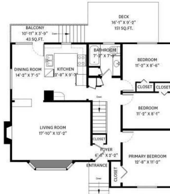
MAIN FLOOR PLAN Ceiling Height: 8'-0"