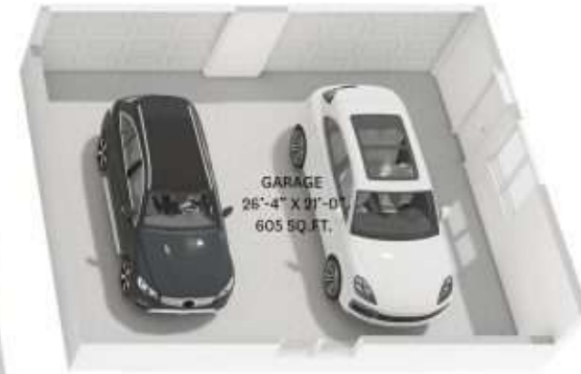
GARAGE Ceiling Height: 8'-4"