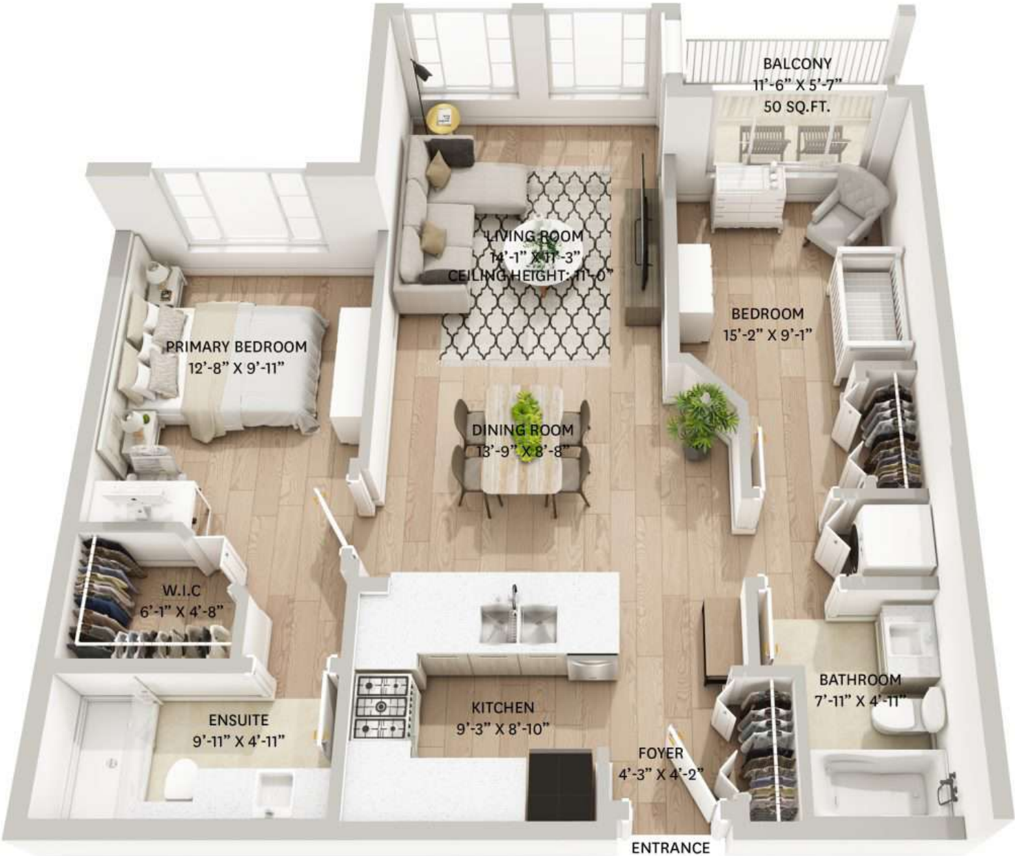
MAIN FLOOR PLAN Ceiling Height: 9'-11"

MAIN FLOOR TOTAL: 915 SQ.FT. BALCONY: 50 SQ. FT.