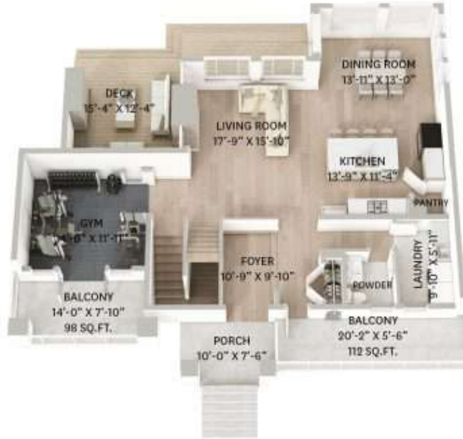
MAIN FLOOR PLAN Ceiling Height: 10'-0"