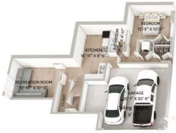
LOWER FLOOR PLAN Ceiling Height: 8'-0"

LOWER FLOOR TOTAL: 859 SQ.FT. GARAGE: 482 SQ. FT. MAIN FLOOR TOTAL: 1,255 SQ.FT. BALCONY: 289 SQ. FT. UPPER FLOOR TOTAL: 1,166 SQ.FT. DECK: 267 SQ. FT. TOTAL: 3,280 SQ.FT. PORCH: 68 SQ. FT.