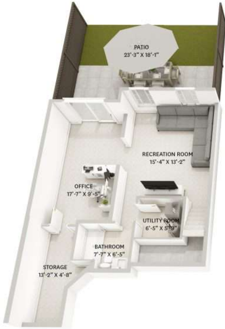
LOWER FLOOR PLAN Ceiling Height: 8'-2"

LOWER FLOOR TOTAL: 676 SQ.FT. GARAGE: 371 SQ. FT. MAIN FLOOR TOTAL: 663 SQ.FT. BALCONY: 47SQ. FT. UPPER FLOOR TOTAL: 849 SQ.FT. PATIO: 398SQ. FT. TOTAL: 2,188 SQ.FT.