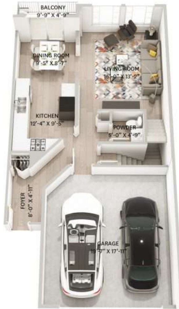
MAIN FLOOR PLAN Ceiling Height: 8'-0"