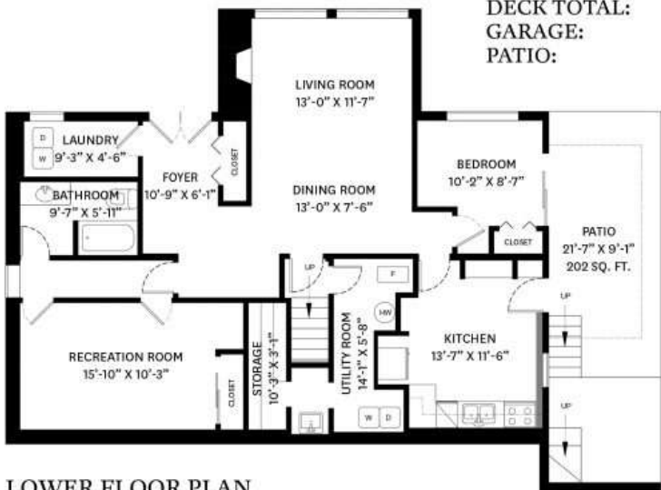
LOWER FLOOR PLAN Ceiling Height: 7'-8"

LOWER FLOOR TOTAL: 1,315 SQ. FT. MAIN FLOOR TOTAL: 1,336 SQ. FT. TOTAL: 2,651 SQ. FT. DECK TOTAL: 368 SQ. FT. GARAGE: 268 SQ. FT. PATIO: 202 SQ. FT.