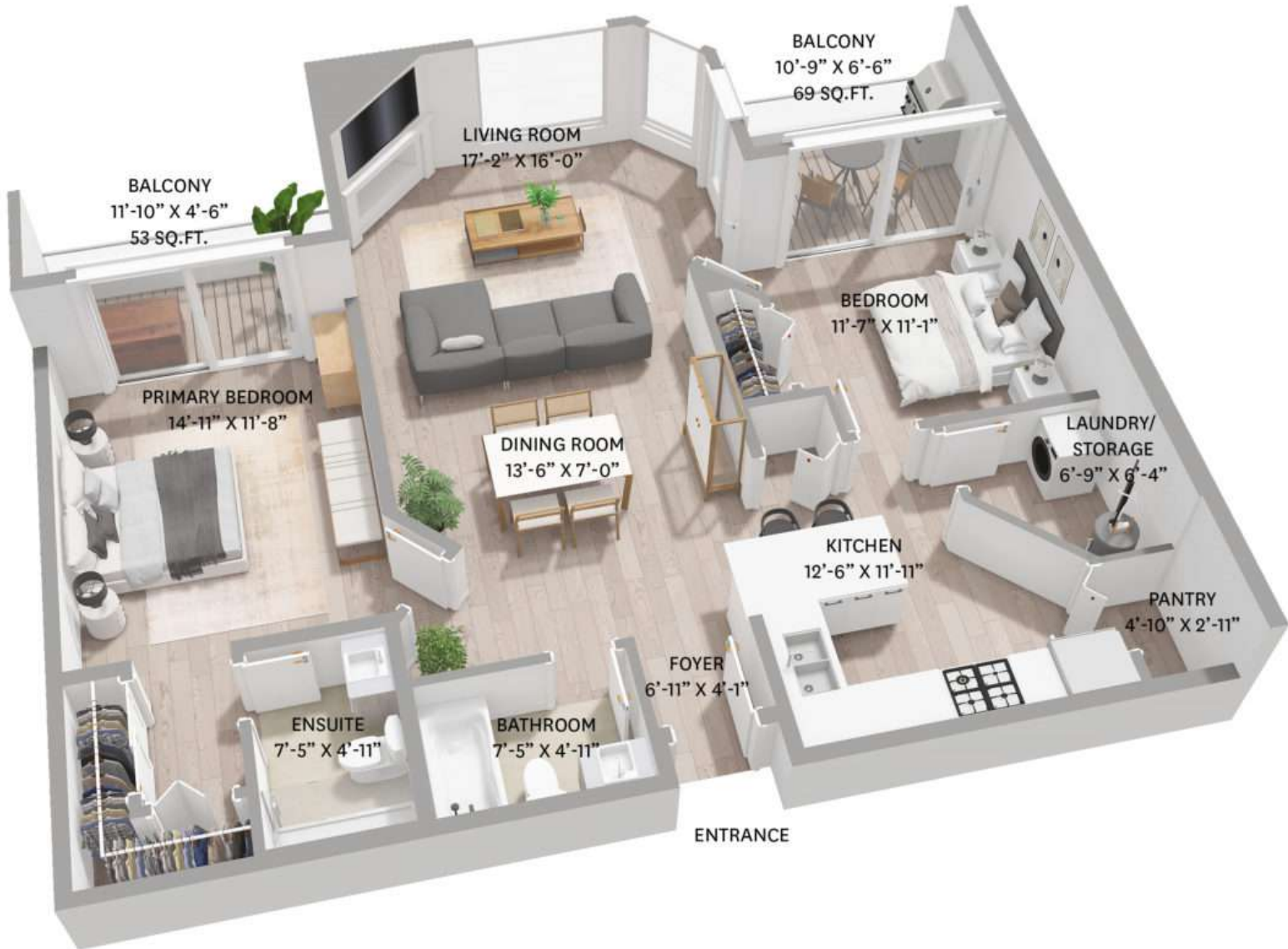
MAIN FLOOR PLAN Ceiling Height: 7'-11"

MAIN FLOOR TOTAL: 1,129 SQ.FT. BALCONY TOTAL: 122 SQ. FT.