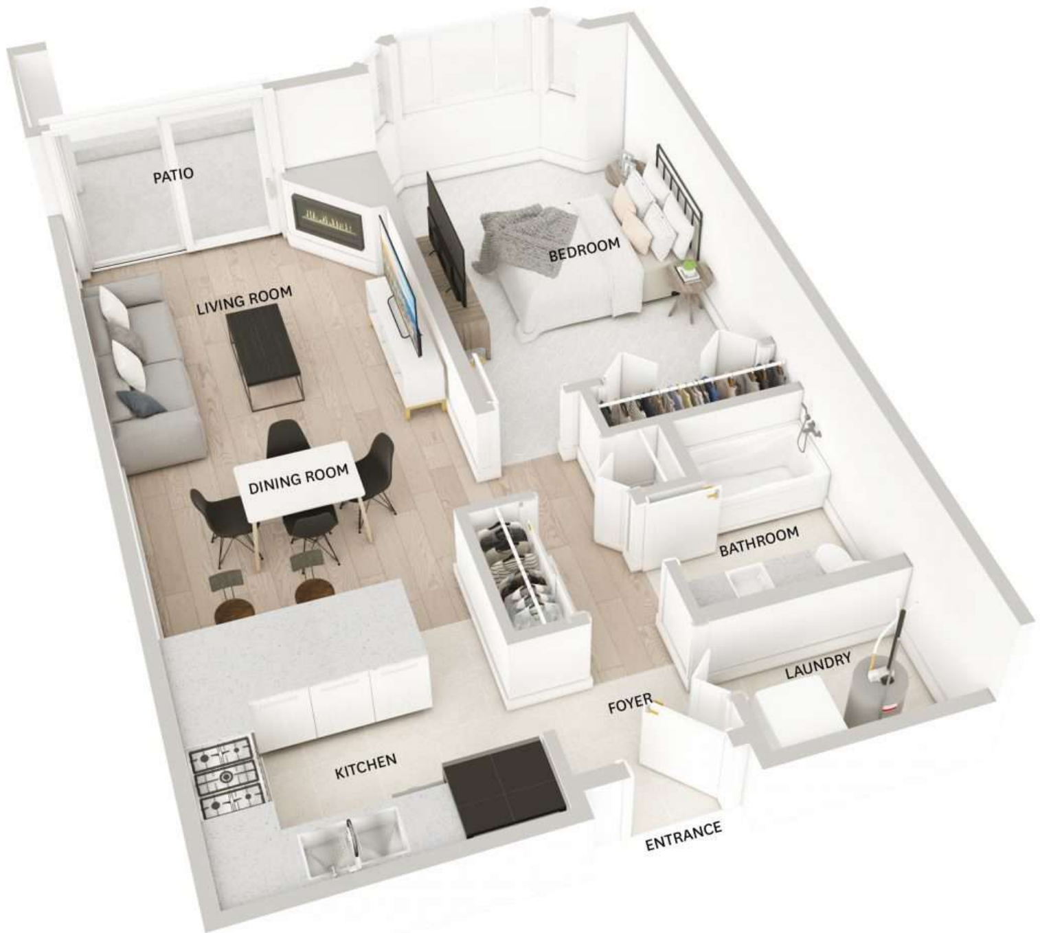
MAIN FLOOR PLAN Ceiling Height: 7'-11"