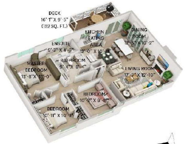
MAIN FLOOR PLAN Ceiling Height: 8'-0"

GARAGE: 479 SQ. FT. PATIO: 352 SQ. FT. DECK: 572 SQ. FT.