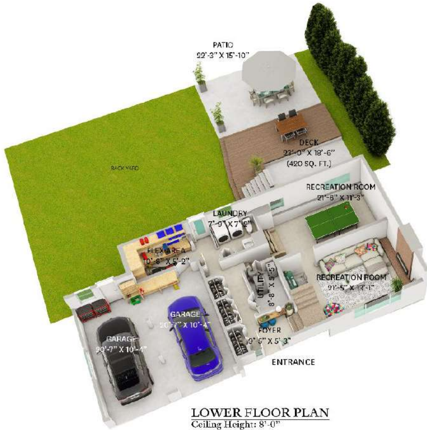
LOWER FLOOR PLAN Ceiling Height: 8'-0"

LOWER FLOOR TOTAL: 990 SQ. FT. MAIN FLOOR TOTAL: 1,281 SQ. FT. TOTAL: 2,271 SQ. FT.