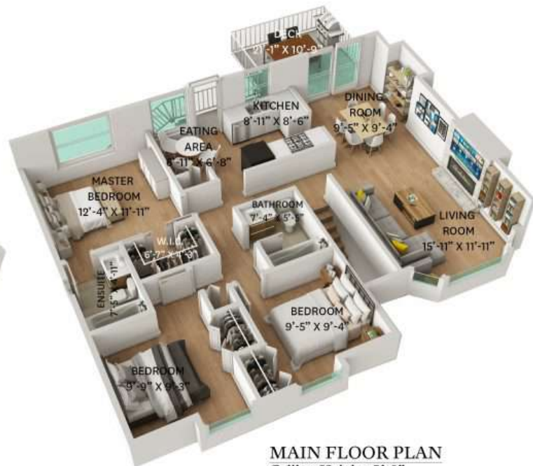
MAIN FLOOR PLAN Ceiling Height: 8'-0"