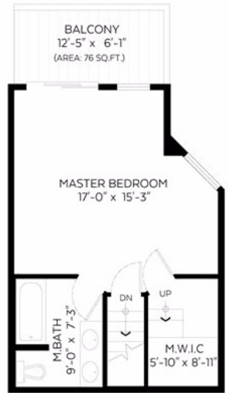
Top Floor Plan Floor Area: 433 sq.ft.