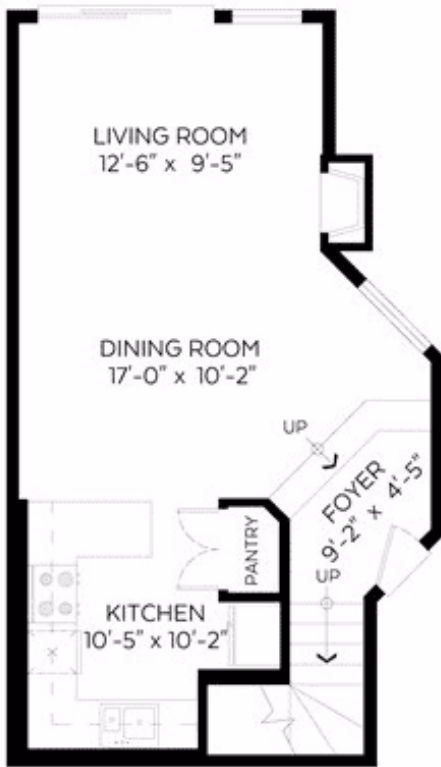
Main Floor Plan Floor Area: 485 sq.ft.