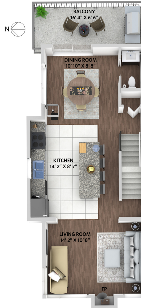
Main Floor - 588 sq.ft. Ceiling height - 8' 0"