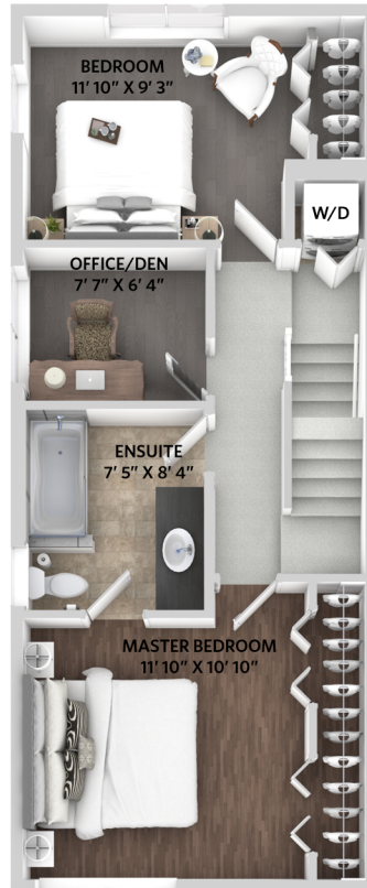
Upper Floor - 548 sq.ft. Ceiling height - 8' 0"