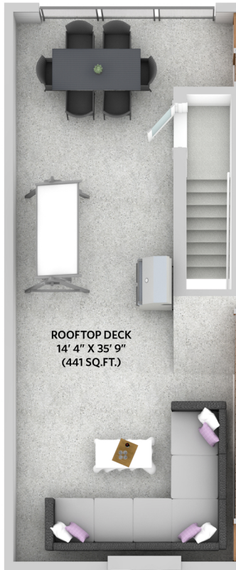
Top Floor - 78 sq.ft. Ceiling height - 8' 0"