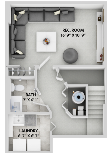
Lower Floor - 476 sq.ft. Ceiling height - 7' 7"