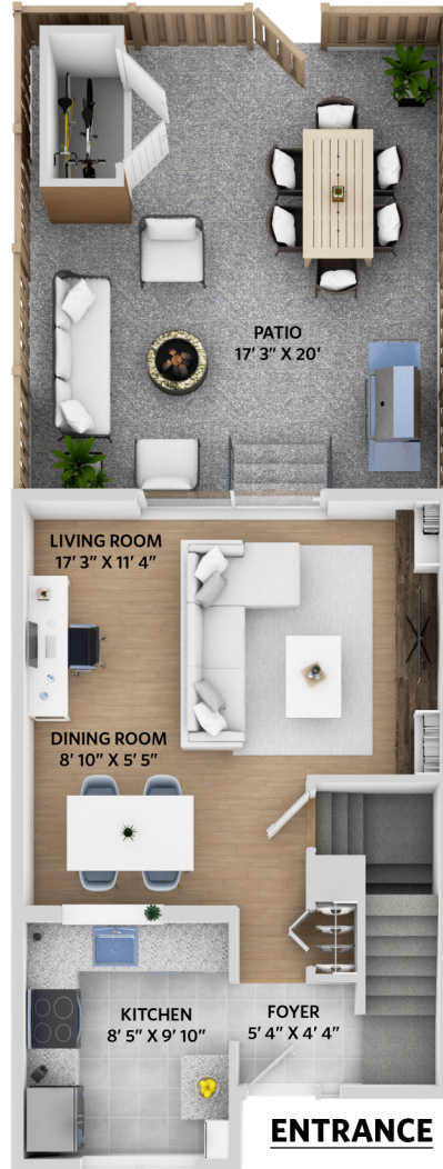
Main Floor - 476 sq.ft. Ceiling height - 8' 0"