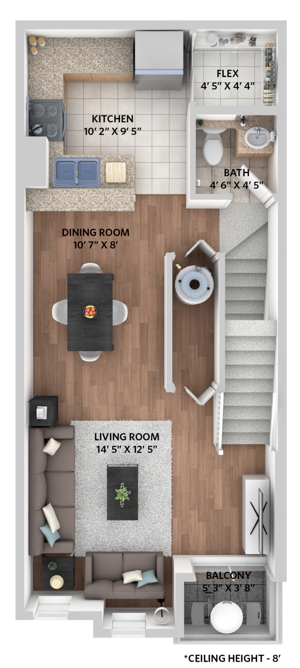
LOWER FLOOR 36 SQ.FT.