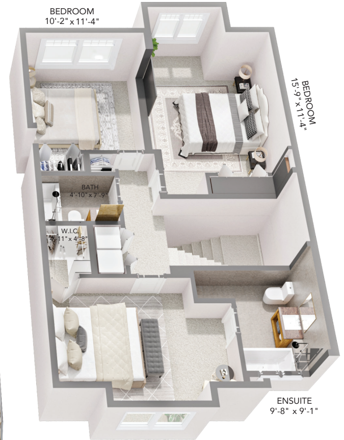
UPPER FLOOR PLAN Ceiling Height: 8'-0"