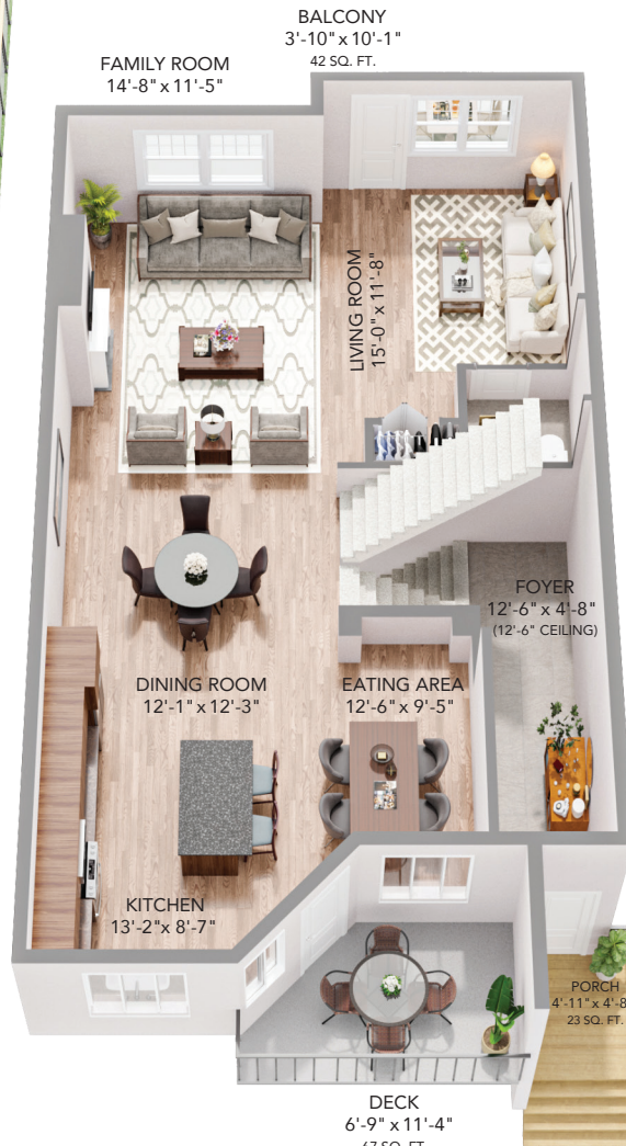
MAIN FLOOR PLAN Ceiling Height: 8'-11"