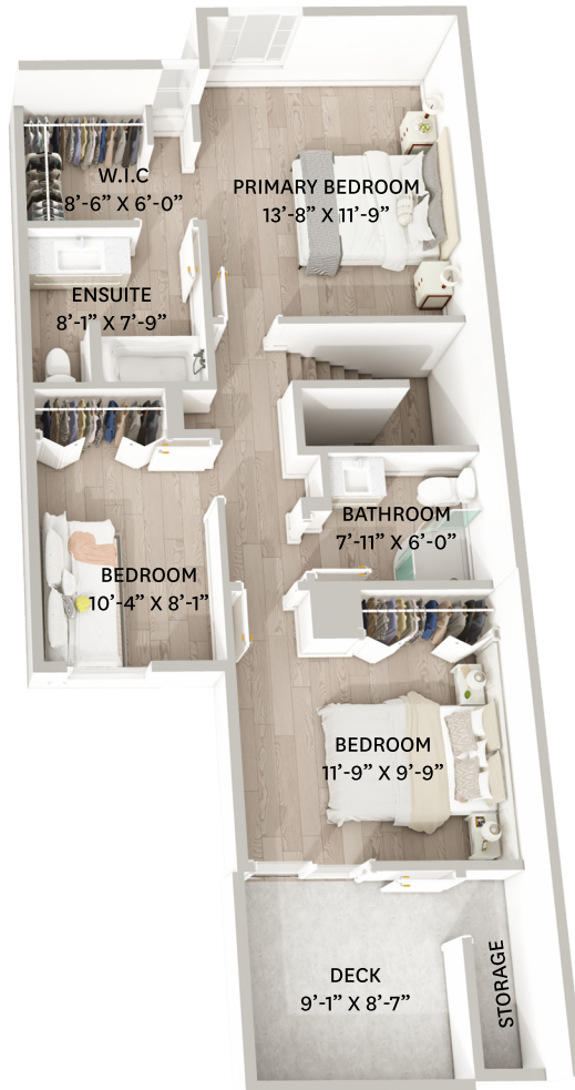
UPPER FLOOR PLAN Ceiling Height: 7'-11"