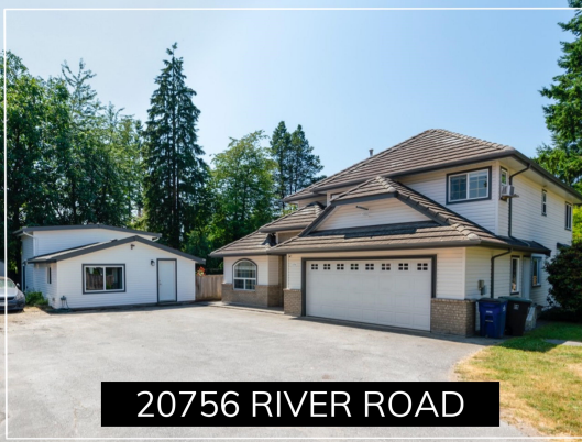
20756 RIVER ROAD

Active R2763688 Board: V House/Single Family 20756 RIVER ROAD Maple Ridge Southwest Maple Ridge V2X 1Z7 Residential Detached $1,600,000 (LP) (SP)